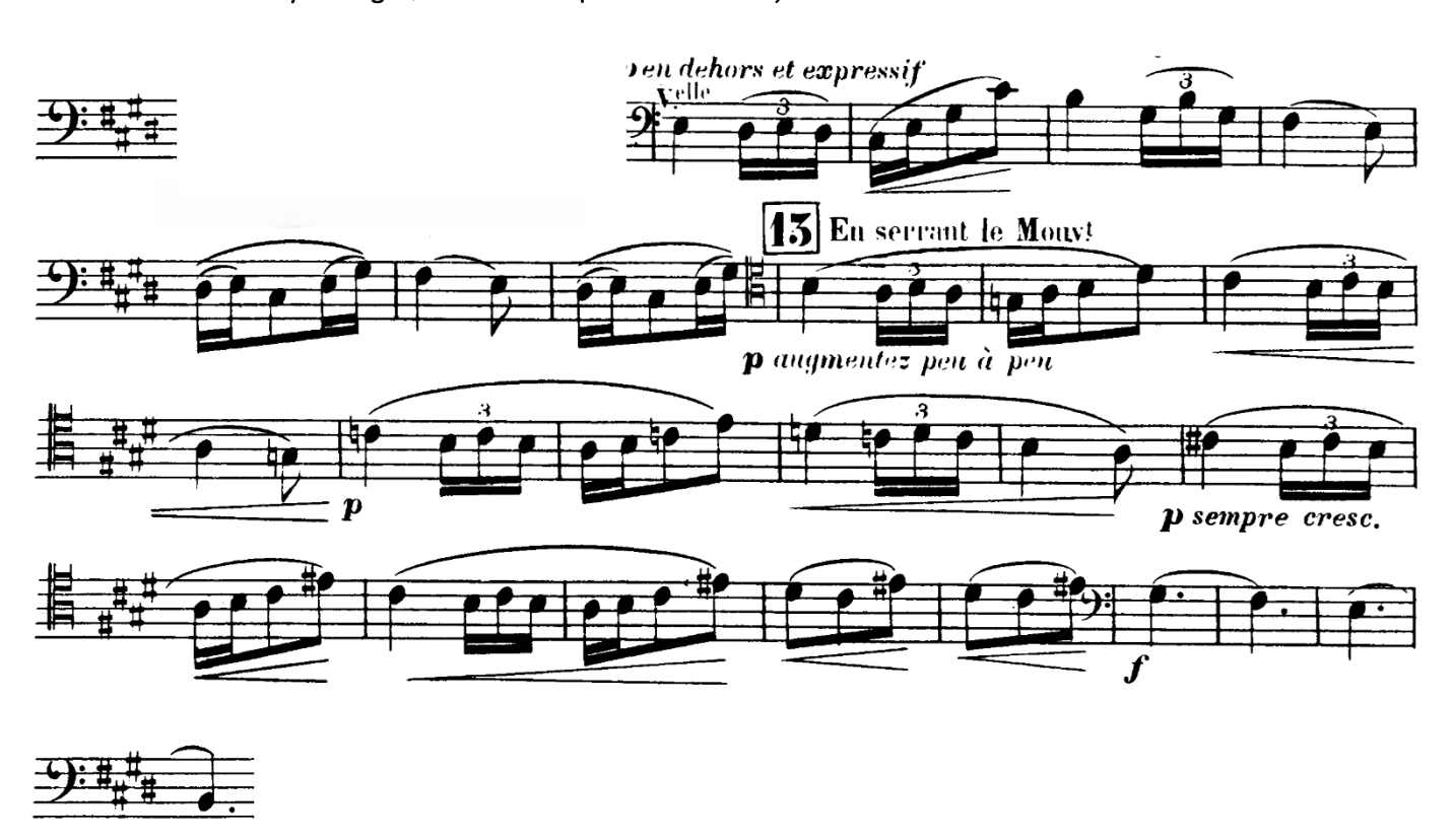
EXCERPT 1 From Debussy String Quintet No. 1 (3rd movement)

Recordings should be sent to <a href="mailto:info@wayachamp.com">info@wayachamp.com</a> by Monday 3 March